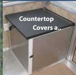
Countertop Covers a...