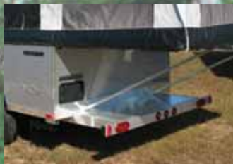
Rear Aluminum Deck

Whether you are an avid outdoors lover, or just enjoy tent camping with your family - the rugged, yet ultra lightweight QUICKSILVER XLP is your best choice for enjoying the RV lifestyle utilizing your current family vehicle! This compact unit can be towed by larger passenger cars, and any crossover vehicle or minivan. Featuring a full LP package with furnace, refrigerator, and exterior hookup for a grill, the XLP features loads of interior and exterior storage - including enclosed storage bins on the front of the unit and a sturdy aluminum rear deck on the rear.