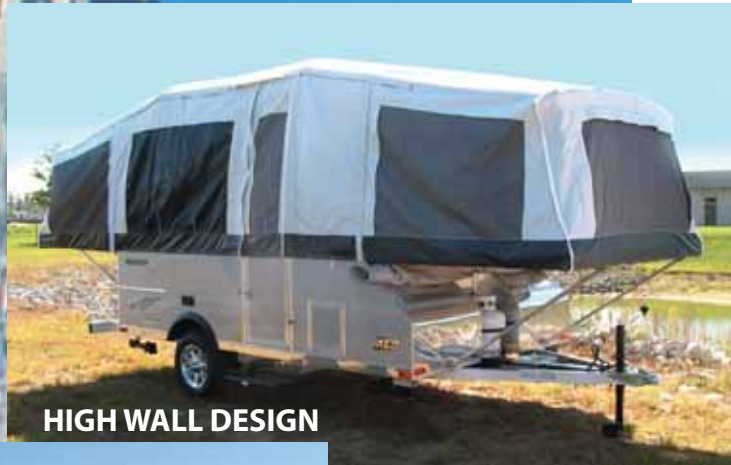
HIGH WALL DESIGN

Featuring FULL LP! The industry's lightest tent campers just got better! The all- new QUICKSILVER XLP model is your best choice for ultra lightweight camping! This compact unit opens up to a massive 20' interior with 6'-4" ceiling height and features more storage than any model in its class.